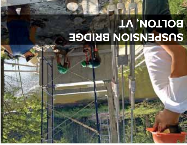
SUSPENSION BRIDGE BOLTON, VT