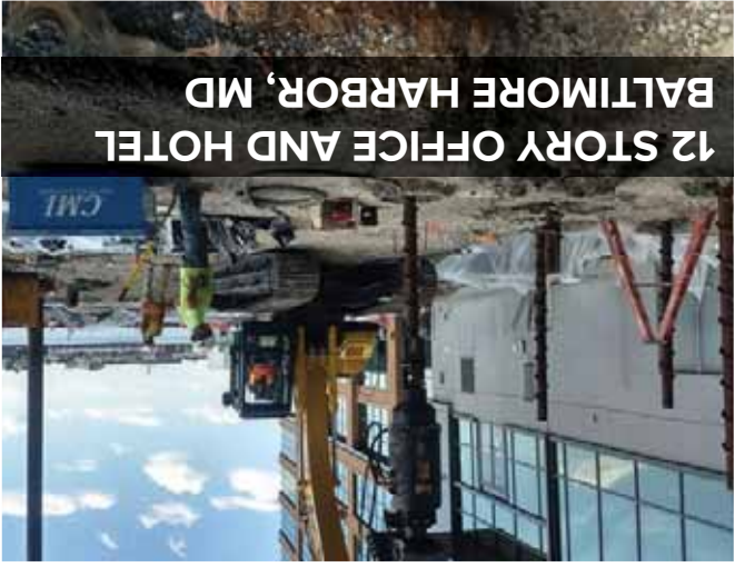
12 STORY OFFICE AND HOTEL BALTIMORE HARBOR, MD