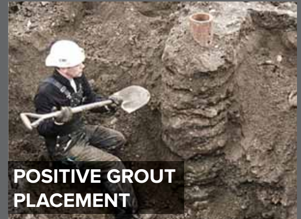
POSITIVE GROUT PLACEMENT