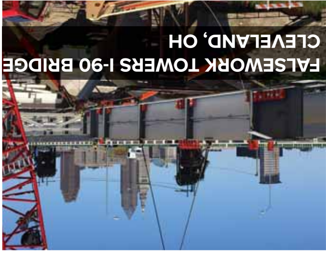
FALSEWORK TOWERS I-90 BRIDGE CLEVELAND, OH