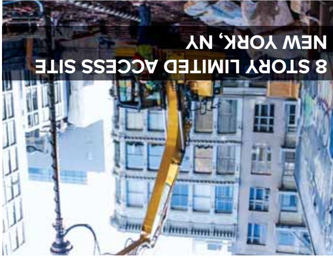
8 STORY LIMITED ACCESS SITE NEW YORK, NY