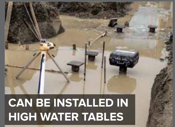
CAN BE INSTALLED IN HIGH WATER TABLES