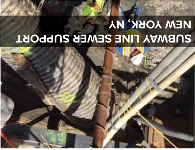
SUBWAY LINE SEWER SUPPORT NEW YORK, NY