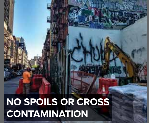
NO SPOILS OR CROSS CONTAMINATION