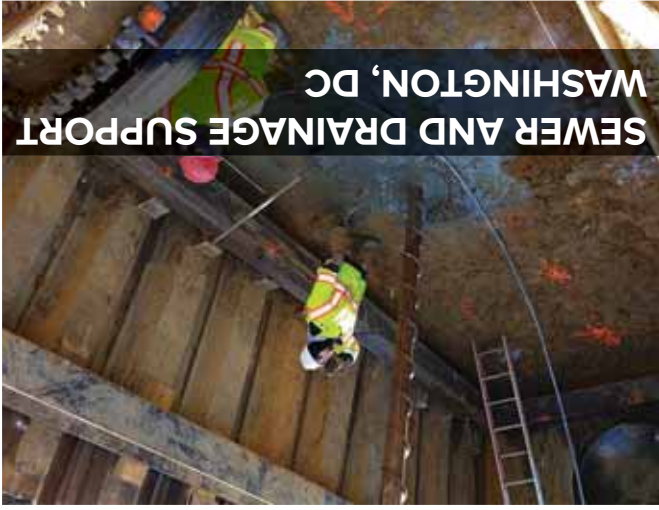
SEWER AND DRAINAGE SUPPORT WASHINGTON, DC